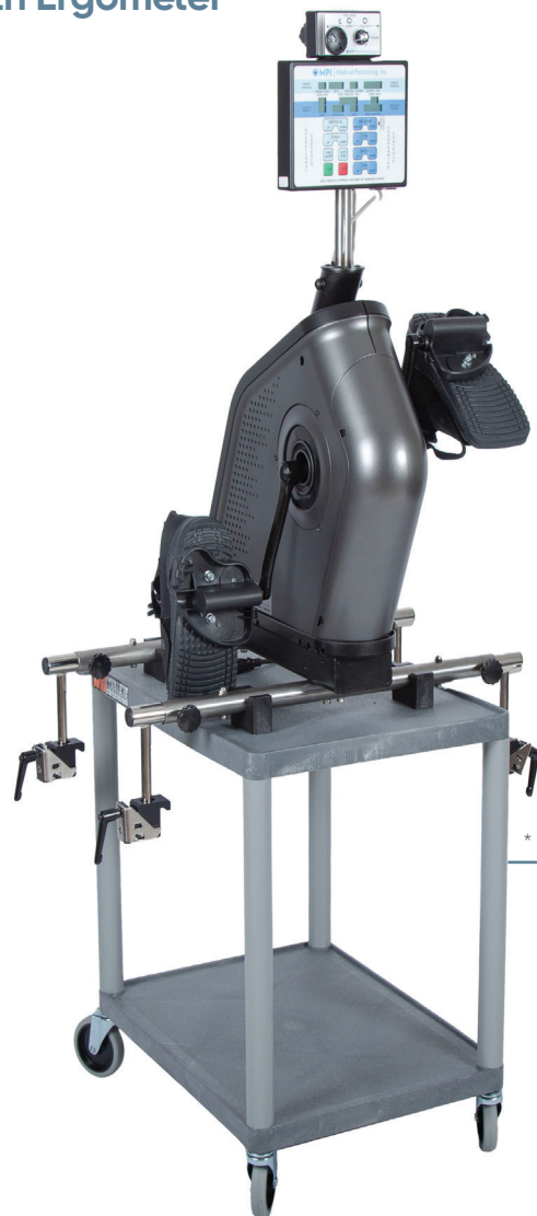
* STORAGE CART