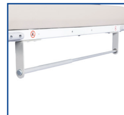
Paper Roll Holder and Cutter