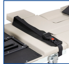
Patient Safety Belt