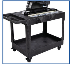
Ergometer Storage Cart