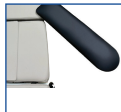
Articulating Padded Arm Board