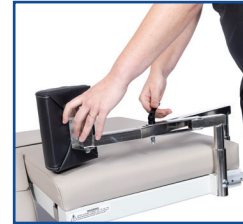
Patient Shoulder Support