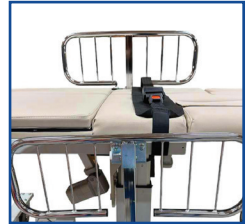
Removable Safety Handrails