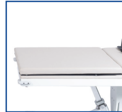
Ergometer Track Cover