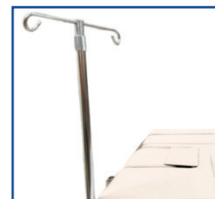
IV Pole and Holder