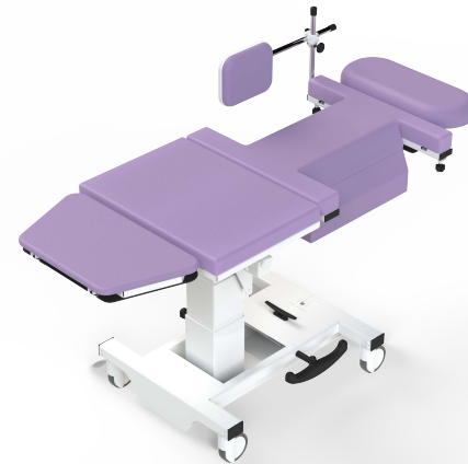
Convertible platform for 360° access to breast