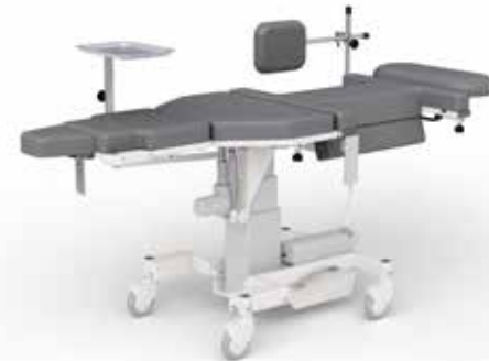
Convertible platform for 360° access to breast